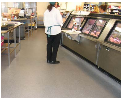
Woolworths Supermarket, Nowra